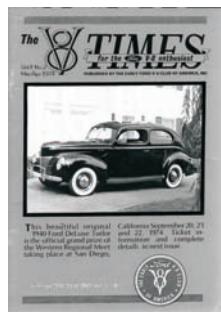
Motor Company in 1932 and was instrumental in